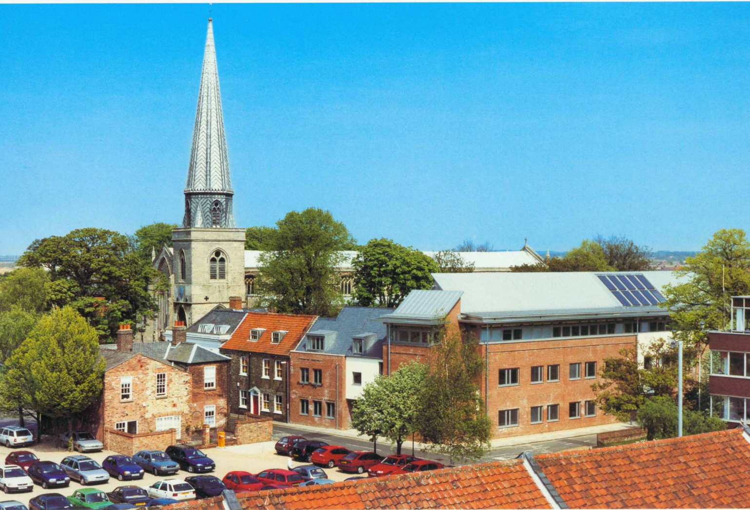
▲ The housing in Chapel Street is clearly linked to the larger office range in colour and materials but at the same time responds to the scale of adjoining housing.