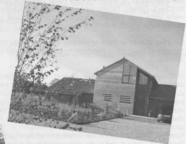
Mulberry Barn Langmere