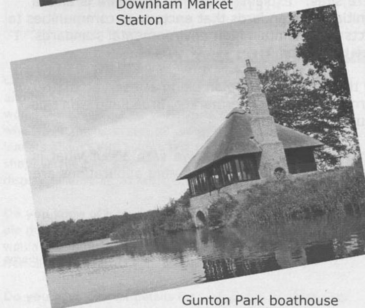
Gunton Park boathouse